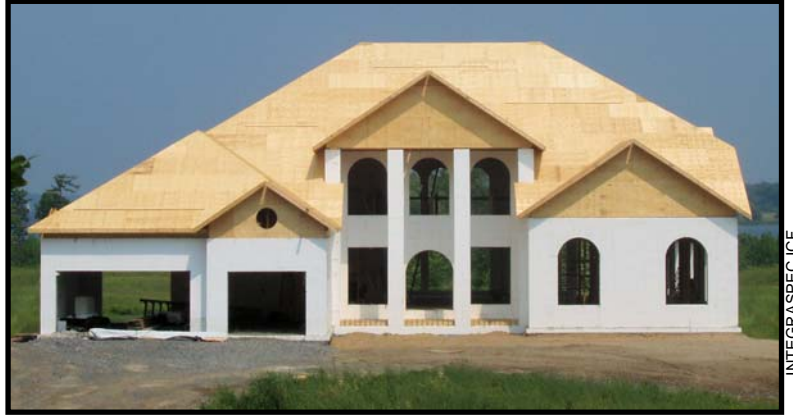
A continuous wall of insulation helps maximize the ICF Effect

Prior to the oil crisis in the 1970's, energy was cheap and little focus was placed on insulation, as evidenced by the lack of any insulation in "mid-century" homes. The skyrocketing fuel prices triggered a need for immediate improvements in energy efficiency in homes, and minimum R-values were prescribed as a quick remedy. These values were based on the insulation materials that were typical at the time, measured by the existing hot box testing method 1 . The resulting R-value is the resistance to heat flow of a given material, measured in a steady state. Of